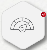
Security & Privacy Score